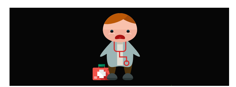
Myth - Provincial, National, and Global Best Practices Supports Needle Exchange Programs.

Fact: With multiple uses, the tip of the needle becomes weakened and can break off and stuck under the skin. Also, a reused needle becomes dull and doesn't inject as easily as a new one and can cause pain, bleeding, bruising, and infections.