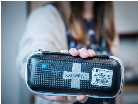
Take Home Naloxone Program Kits