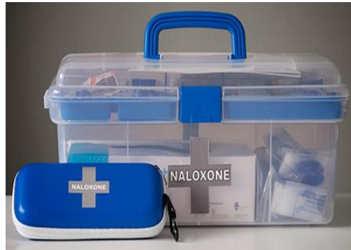
Facility Overdose Response Program Kit/Box