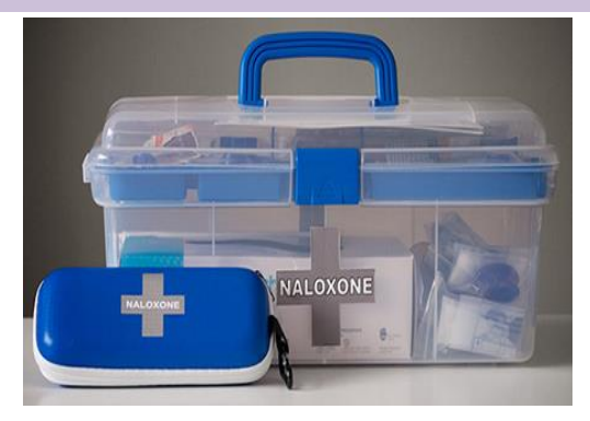
Facility Overdose Response Program Kit/Box