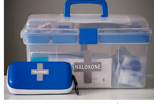
Take Home Naloxone Program Kits