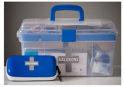
Facility Overdose Response Program Kit/Box